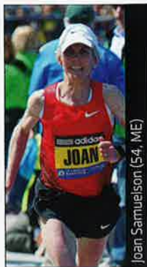
Joan Samuelson (54, ME)