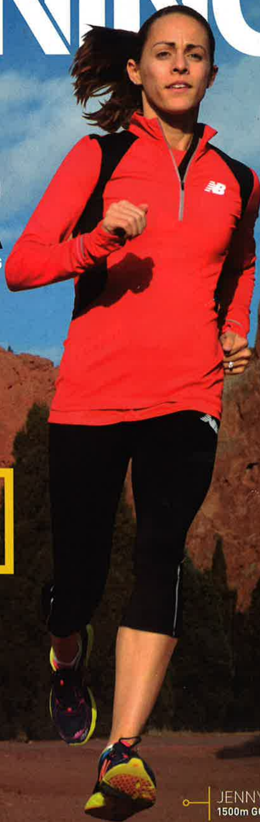
JENNY SIMPSON 1500m GOLD MEDALIST